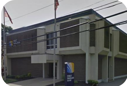
BANK BRANCH Highland Falls, New York Original Assessment $1,947,800 Revised Assessment $1,250,000 Reduction of 36%