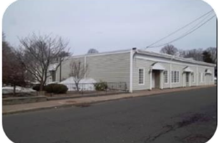
BANK BRANCH Manchester, Connecticut Original Assessment $1,177,857 Revised Assessment $632,286 Reduction of 46%