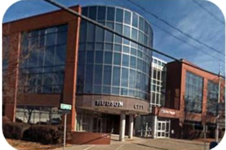
BANK BRANCH/ BANK OFFICES Hudson, New York Original Assessment $8,444,383 Revised Assessment $2,370,000 Reduction of 72%