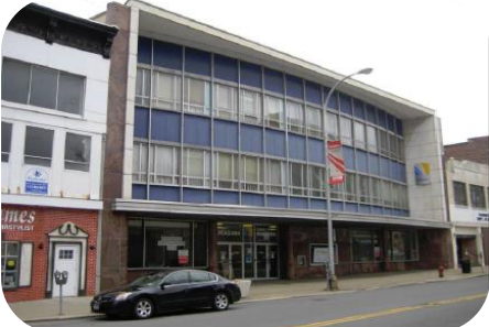
BANK BRANCH/ BANK OFFICES Schenectady, New York Original Assessment $2,062,500 Revised Assessment $290,000 Reduction of 86%