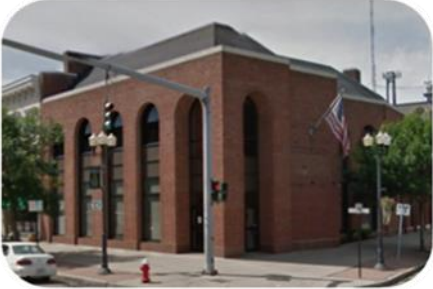
BANK BRANCH Geneva, New York Original Assessment $994,845 Revised Assessment $600,000 Reduction of 40%