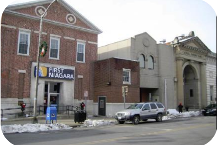
BANK BRANCH Catskill, New York Original Assessment $1,200,000 Revised Assessment $447,074 Reduction of 63%