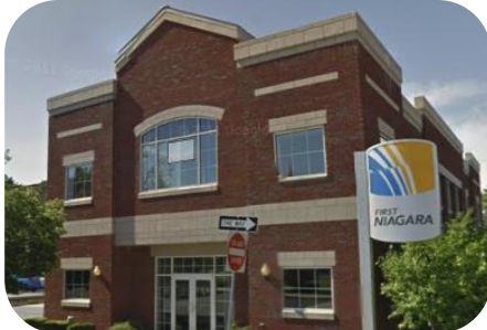
BANK BRANCH Cohoes, New York Original Assessment $2,155,179 Revised Assessment $1,450,000 Reduction of 33%