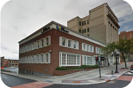
BANK BRANCH Albany, New York Original Assessment $1,980,500 Revised Assessment $1,250,000 Reduction of 37%