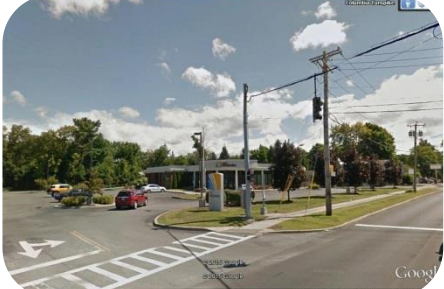
BANK BRANCH East Greenbush, New York Original Assessment $925,000 Revised Assessment $490,000 Reduction of 47%