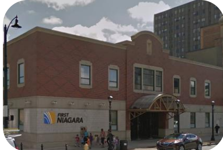
BANK BRANCH Erie, Pennsylvania Original Assessment $3,299,700 Revised Assessment $2,300,000 Reduction of 30%