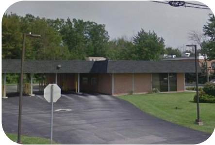
BANK BRANCH Amherst, New York Original Assessment $1,109,890 Revised Assessment $750,000 Reduction of 32%