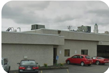
BANK BRANCH Lockport, New York Original Assessment $677,600 Revised Assessment $450,000 Reduction of 34%