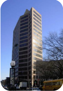
BANK OFFICES New Haven, Connecticut Original Assessment $29,254,610 Revised Assessment $20,500,000 Reduction of 43%