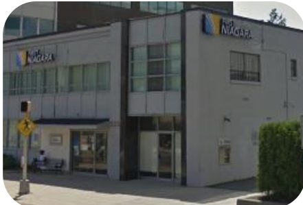
BANK BRANCH Stamford, Connecticut Original Assessment $2,604,543 Revised Assessment $1,742,400 Reduction of 33%